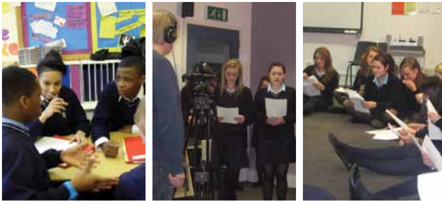
Behind the scenes during the making of Virtual Visions

If you are interested in receiving a copy of Virtual Visions , please email: support@ocr.org.uk