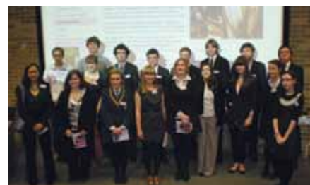
The Great Debate finalists