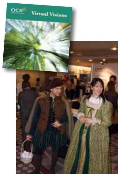
NATE – promoting excellence

More information on the NATE Conference can be found at: www.nate.org.uk